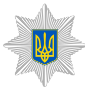
National Police of Ukraine

Coordination Centre for Victim and Witness Support